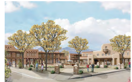
Aldea Plaza, Santa Fe

P.O. Box 223 Taos Ski Valley, New Mexico 87525 21 Plaza Nueva • Aldea Plaza • Santa Fe, New Mexico 87507 Telephone: 505.231.1454 Fax: 505.995.0075 www.CometStudios.com comet@CometStudios.com