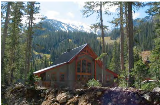
Taos Ski Valley, Kachina Residence