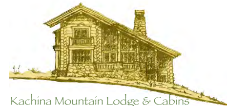
Kachina Mountain Lodge & Cabins Taos Ski Valley, New Mexico

The Studios philosophy incorporates environmentally conscious green building design with innovative, cost effective, & energy efficient passive solar solutions, in context with the surrounding community & the natural environment.